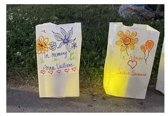
American Cancer Society Relay for Life event is on Friday, May 31st, 2024.

Relay for Life is a walk to raise awareness of the impact that cancer has on so many in the community. The event raises money to support much-needed services offered to cancer warriors and their loved ones. The funds raised by this event help aid in cancer research, cover the cost of hotel stays for patients and caregivers receiving treatment far from home, and for transportation services, as well as providing a 24-hour hotline to call for support and questions. Most importantly, Relay for Life is a chance to celebrate cancer survivors and their caregivers, remember loved ones lost, and fight back against every cancer as we come together for every life.